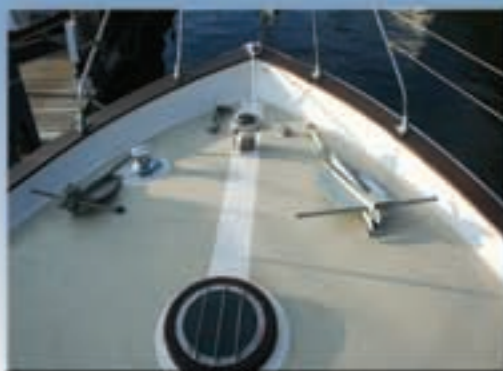
MARINE AND BOATING APPLICATIONS