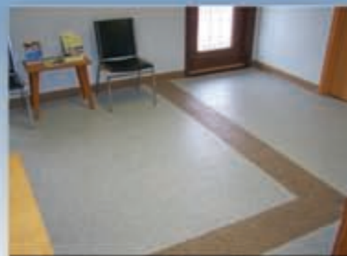
GRANIFLEX SYSTEM W/ POLYMER FLAKES