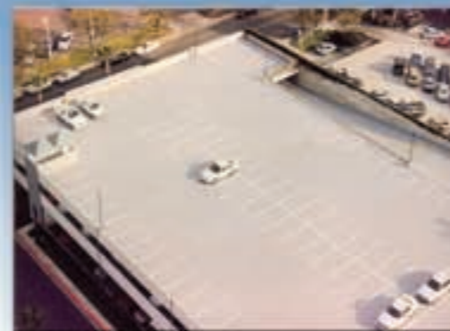
PARKING GARAGE APPLICATIONS