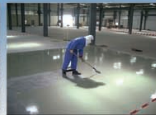
ENDLESS INDUSTRIAL APPLICATIONS