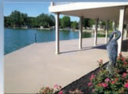
GRANIFLEX SYSTEM W/ QUARTZ BROADCAST